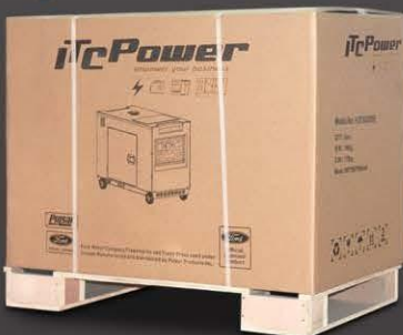
Individual pallet packing