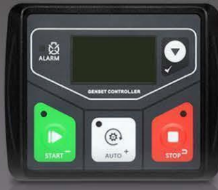
DC30 (ATS) Smart controller