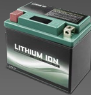
4Ah / 6Ah Lithium Battery