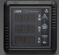
LED6 Voltage AC Power output Frequency / Current Battery voltage Working time