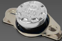
Temperature Sensor to stop