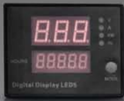
LED5 Voltage AC Power output Frequency Current Working time