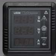
LED6 Voltage AC Power output Frequency Battery voltage Current Working time