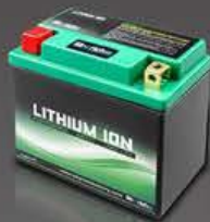
4Ah Lithium battery