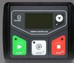
D30 (ATS) Smart controller